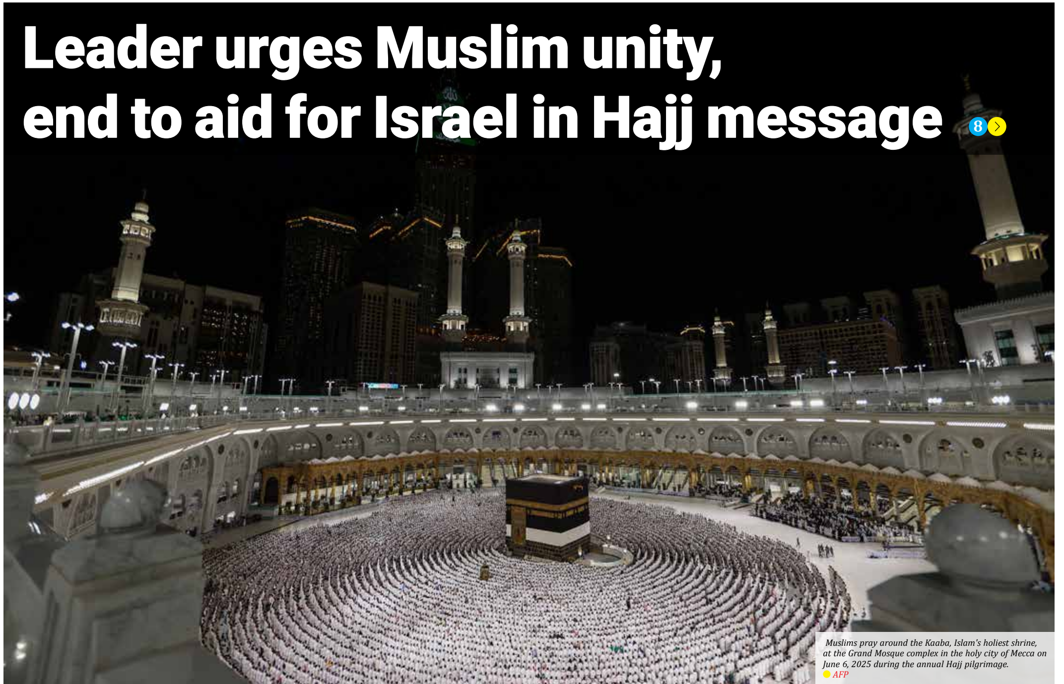
Muslims pray around the Kaaba, Islam's holiest shrine, at the Grand Mosque complex in the holy city of Mecca on June 6, 2025 during the annual Hajj pilgrimage.